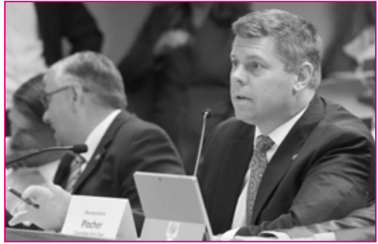
Representative Plocher in committee.